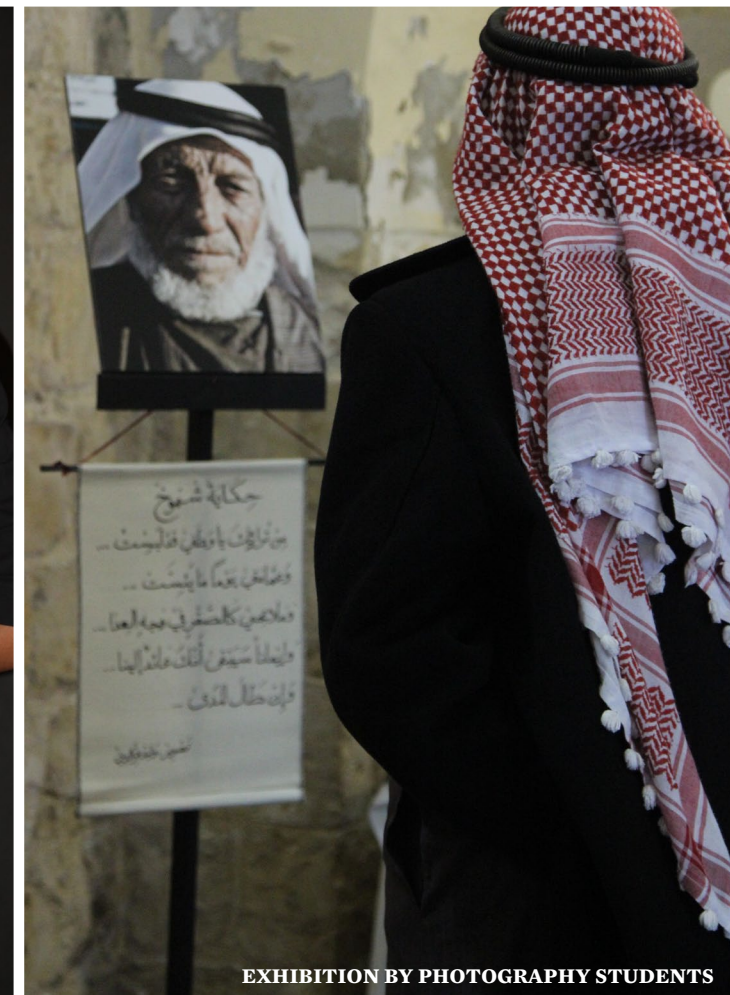
EXHIBITION BY PHOTOGRAPHY STUDENTS