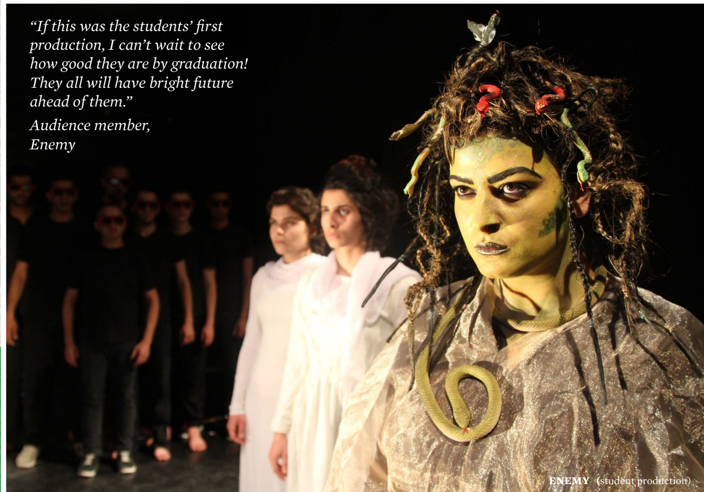
ENEMY (student production)