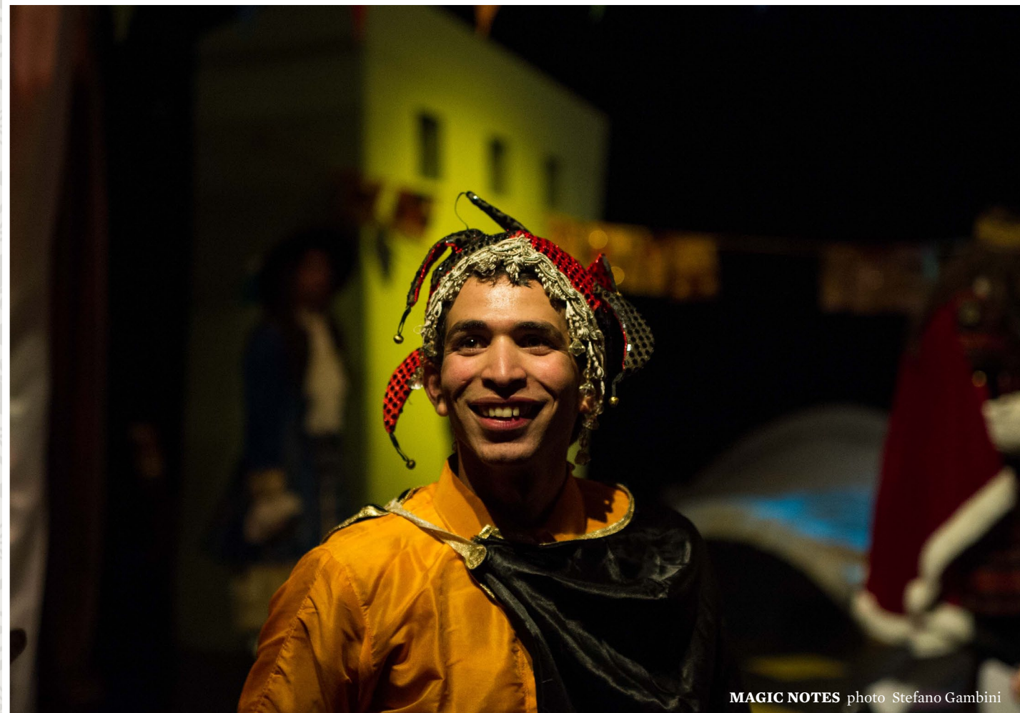
MAGIC NOTES

Throughout 2015, The Freedom Theatre will further develop its organisational sustainability and continue the capacity development of all its resources.