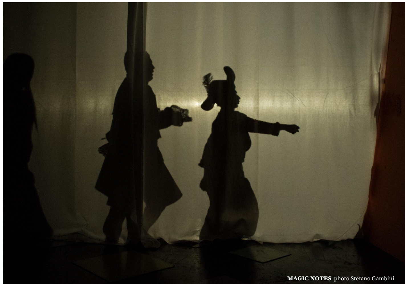
MAGIC NOTES

Join us in looking proudly upon some of the main highlights of 2014, and catch a glimpse of what is to come in 2015: