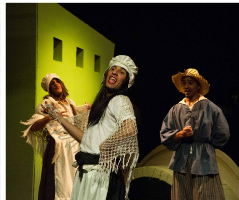
MAGIC NOTES

Following the success of the Freedom Bus project, community members also approached The Freedom Theatre requesting trainings in the method of Playback Theatre. 12 people participated in a five-day introductory training in Playback Theatre with a focus on the method's applicability for popular struggle. The workshop also provided training in movement, voice, improvisational theatre and ensemble work. It was organized in close cooperation with the South Hebron Hills Popular Struggle Committee. By the end of the workshops all participants received a certificate of completion. A final-day performance was attended by 30 women, men and children. Several stories were shared about hostile encounters with the army and settlers and various non-violent actions that the villagers took in response to these threats.