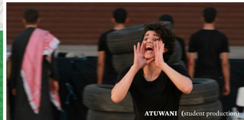
ATUWANI (student production)

Led by The Freedom Theatre School graduates, children aged 9-14 participated in theatre, storytelling and team-building activities during the school holidays. The 10-day summer camp ended with a presentation for families.